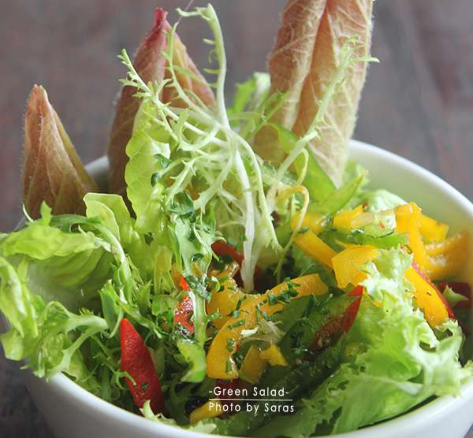
-Green Salad-

Upcoming Event | Meet the Staff | Recent Happenings at ARMA