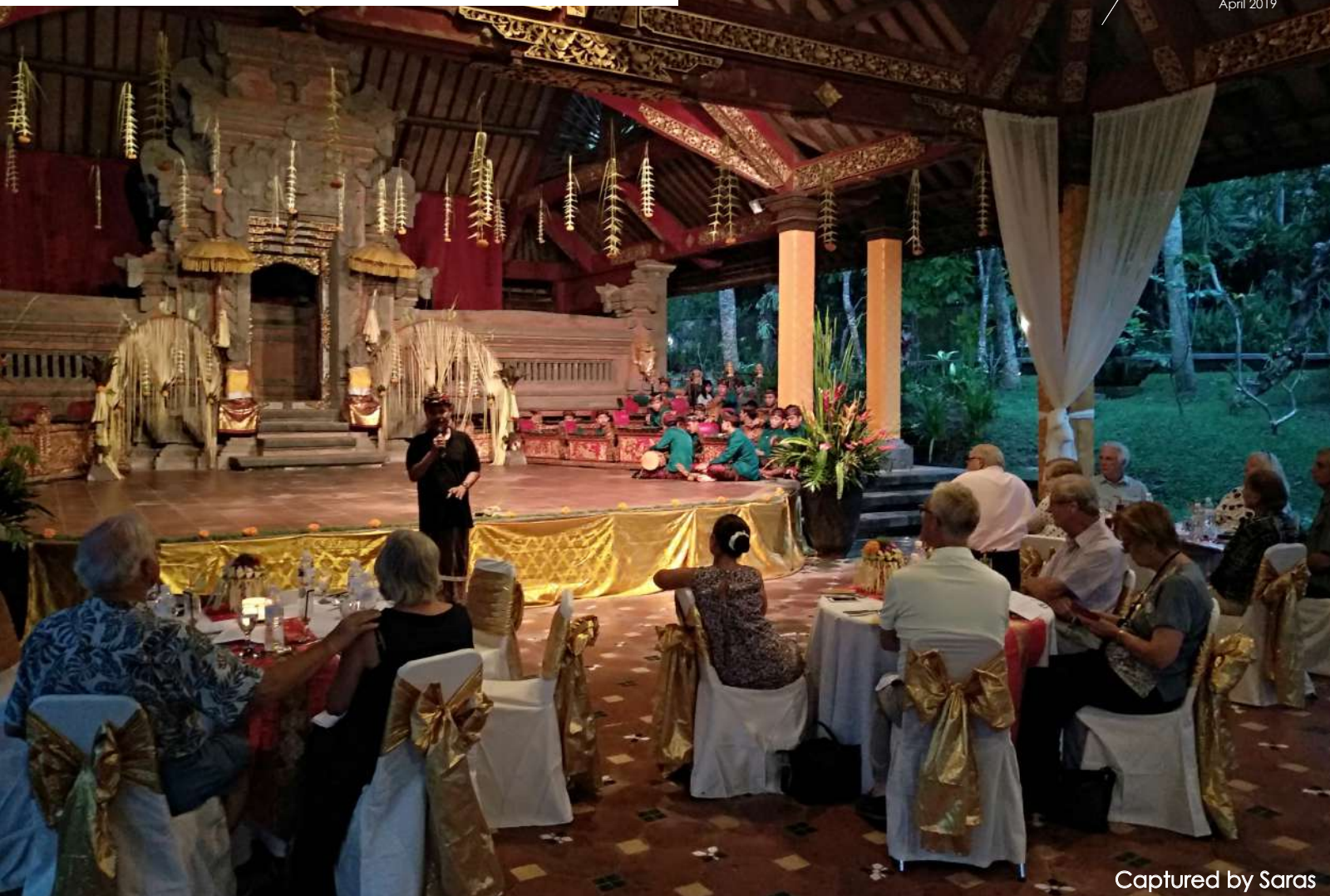
Captured by Saras