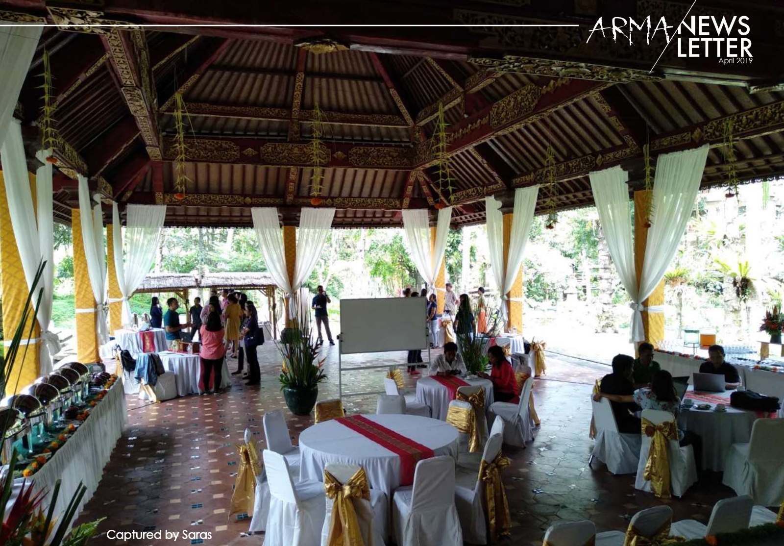
Captured by Saras